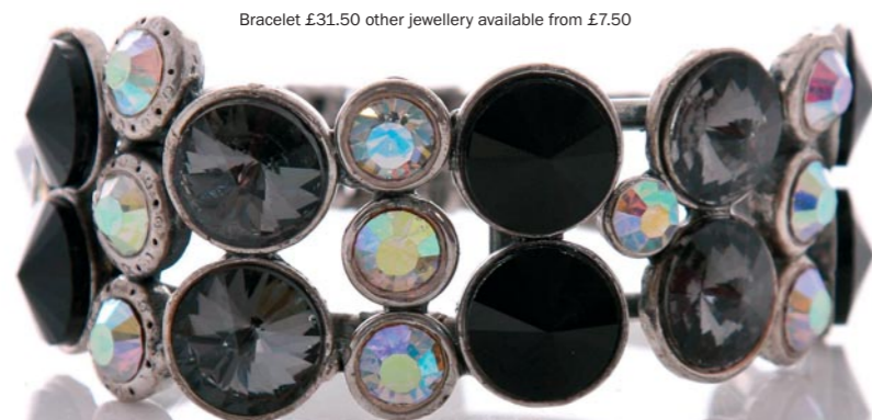
Bracelet £31.50 other jewellery available from £7.50

Design Inspiration 77 Llantrisant Rd, Pontyclun CF72 9DP 01443 449955 info@designinspirationltd.co.uk www.designinspirationltd.co.uk