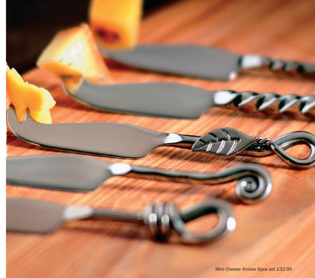
Mini Cheese Knives 6pc set £32.95

Alternatively, if you can't make your mind up, leave it to them - with one of our Gift Vouchers from £10!