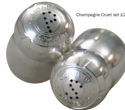
Champagne Cruet set £24

Do you offer a wrapping service? We beautifully wrap our gift range with complimentary bows, bags and ribbons. The men love this service as they can get the other half a wonderful unique gift with it all wrapped up.