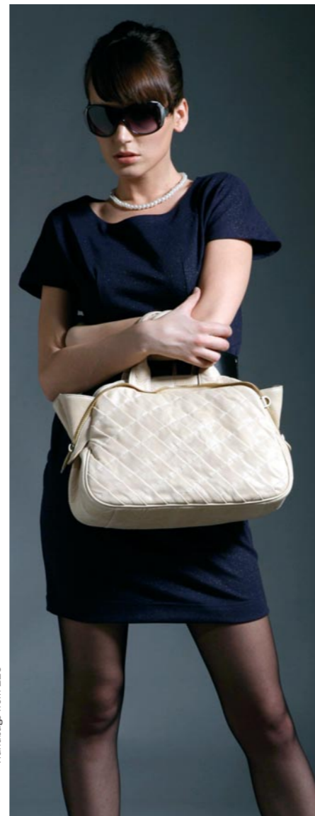
Handbags from £25

We have an exclusive idea from one of our suppliers, the hottest design in tweezers which illuminate your brow for precision plucking, the light is operated by a crystal button and comes complete with its own holder, available in three colours, they are what every girl needs.