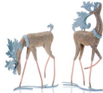
Pair of Reindeer from £18.50 two sizes available