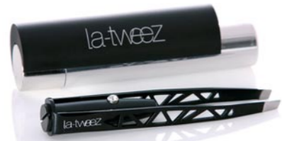
Boxed Illuminated Tweezers £15

At Design Inspiration we are always keeping our eyes open for unusual products that we would love to get ourselves! So keeping the stock fresh with lots of ideas for all members of the family is what we aim to provide with our gift lines and this year is no exception, we are stocked to overflowing with lots of goodies. Just arrived are our exciting new lines for Christmas, including gorgeous scented reeds and candles from Christopher Guy, perfect for taking as a gift to a dinner party, or how about our range of coordinated journals and mugs, ideal as a stocking fillers.