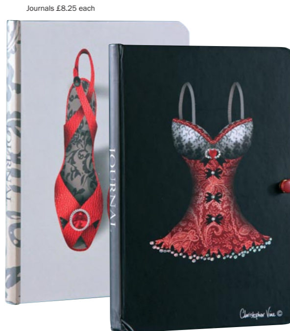
Journals £8.25 each

“We beautifully wrap our gift range with complimentary bows, bags and ribbons.”