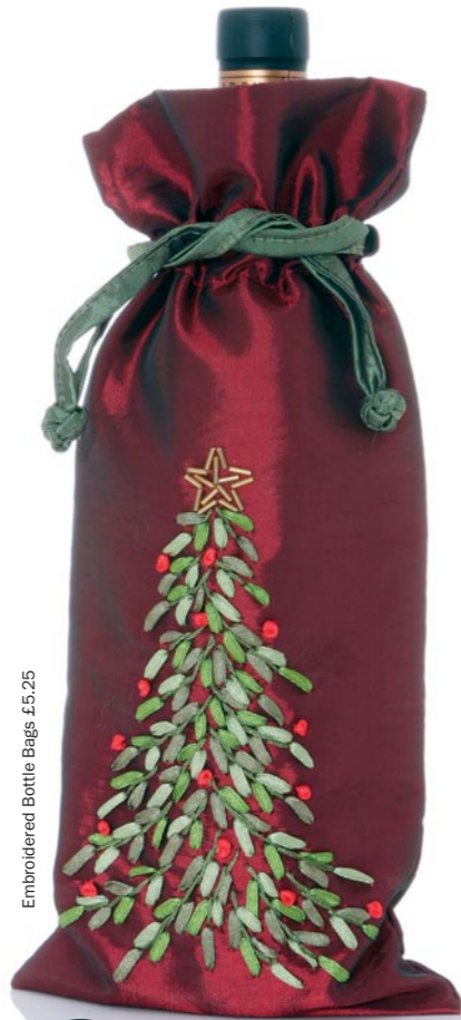
Embroidered Bottle Bags £5.25

Design Inspiration may be well known for its expert interior design service and beautifully made soft furnishings, but the showroom is also a hidden gem for that inspirational gift that need not cost the earth; in fact they have gift ideas to suit all pockets, with stocking fillers from £3.50. We asked designers, Wendy & Rose, to show us some of the ideas they had for that something different, as they went on to explain.